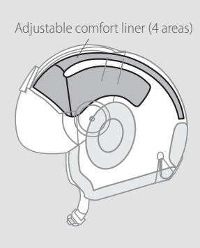
pads system or the adjustabl comfort liner provided in option