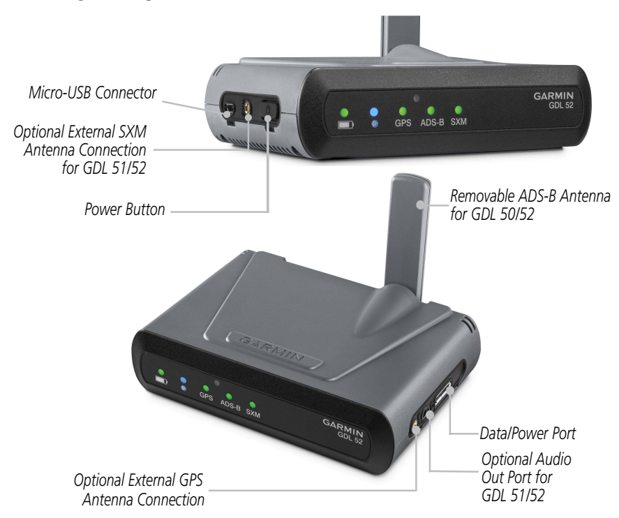
Figure 1 GDL 5X Interface (GDL 52 shown)