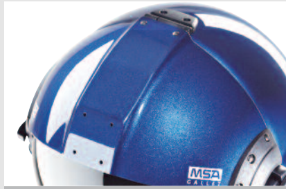
• ANVIS NVG interfaces