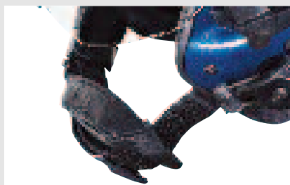
• Flexible, ergonomic and comfortable retention system