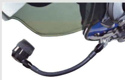
• Various microphones and audio connections available. Contact us