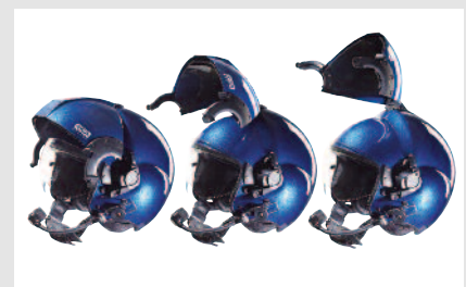
• Adjustable and removable visors without any tools and independently from each other