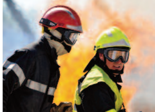
Helmets for forest fire and rescue missions