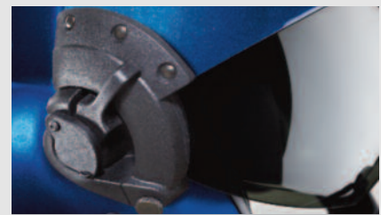
• Inner visor adjustment with right lever