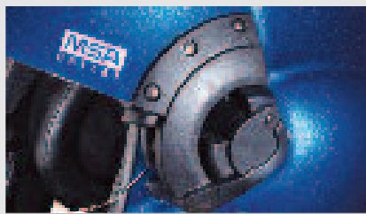
• Outer visor adjustment with left lever