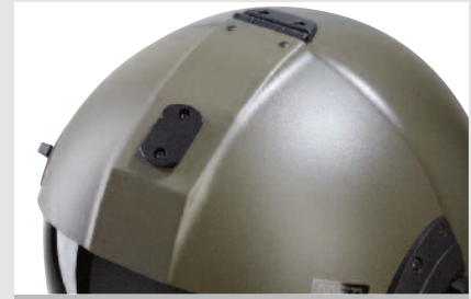
• CN2H-AA NVG interfaces