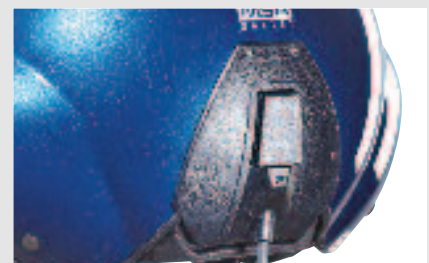
• Centralization of power supply and audio functions